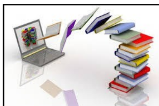
Our online library