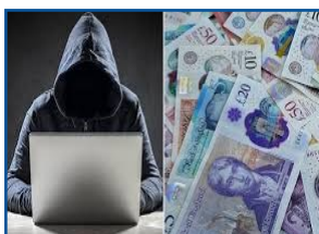
Scams and online safety