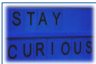
World Elder Abuse Day - Stay Curious Campaign